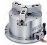
連體氣壓手動切換閥 Adherent type hand control valve