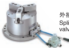
外接氣壓手動切換閥 Split type hand control valve

Examples of attaching pneumatic manual switch and optional accessories.